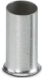
Ferrule, length: 12 mm, color: silver

Please be informed that the data shown in this PDF Document is generated from our Online Catalog. Please find the complete data in the user's documentation. Our General Terms of Use for Downloads are valid ( http://phoenixcontact.com/download )